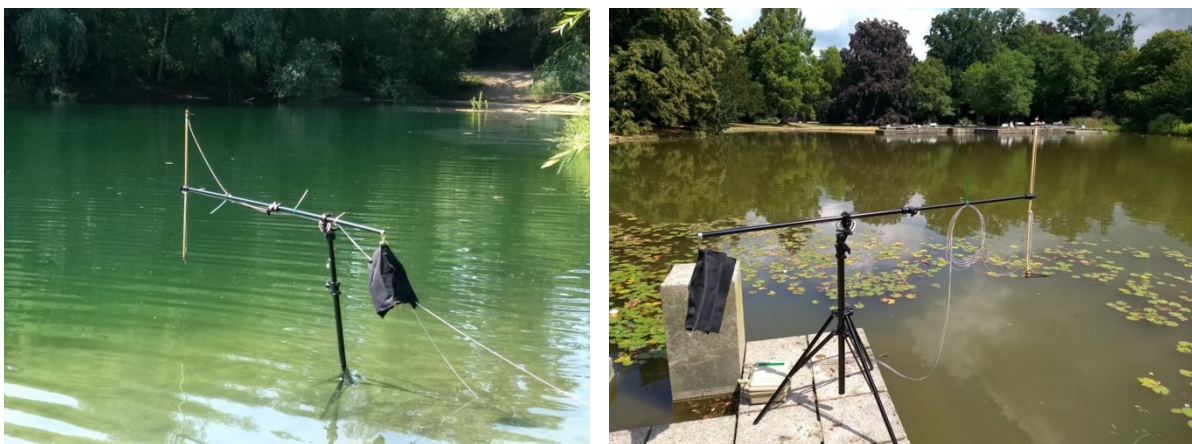
Figure 1: Measurement setup of the RoX spectrometer at a natural water body (left) and an artificial pond (right), taken from Maier & Keller (2019a).

The sampling frequency of the RoX was set to 15 seconds in case of the year 2019 measurements and to 20 seconds in case of the year 2018 measurements. That sampling frequency resulted in three to four spectra per minute. During the measurements in the year of 2018, we took a reference water sample for the measurement of the water parameters every fifth minute which we later analyzed with the AlgaeLabAnalyser in the laboratory. During the measurements in the year of 2019, we sampled in-situ measurements of the water parameters approximately every second minute with the AlgaeTorch. The water samples were collected in a depth of 20 centimeters below the water surface and as close as possible to the spectrometer measurements. Thus, we ensured to record the same water conditions with the remote sensing sensor and the in-situ probes. At each water body, we switched the devices to different spots in the water. Furthermore, we aimed to conduct our measurements under optimal conditions with clear sky and without clouds, nevertheless during a few measurements slight cloud cover occurred.